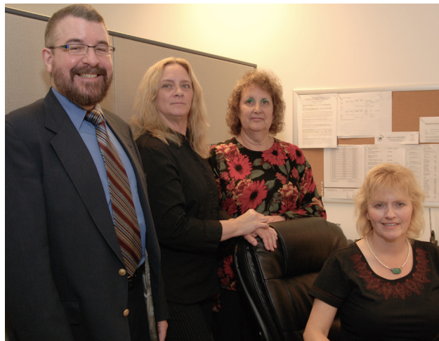
The MCWD Customer Service staff is available to assist you 8:00 a.m. to 5:30 p.m. Monday through Friday, excluding holidays.