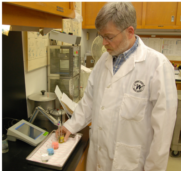
Water Quality Chemist analyzing a water sample

Drinking water, including bottled water, may reasonably be expected to contain at least small amounts of some contaminants. The presence of contaminants does not necessarily indicate that water poses a health risk. More information about contaminants and potential health effects can be obtained by calling the USEPA's Safe Drinking Water Hotline (1-800-426-4791).